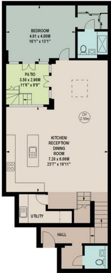
1204 sq ft Lower Ground Floor