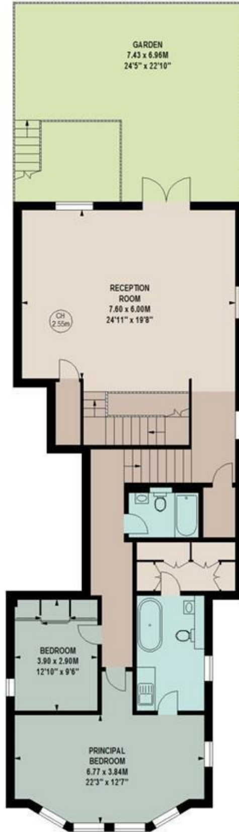
1508 sq ft Ground Floor

The floor plan is not to scale and measurements and areas shown are approximate and therefore should be used for illustrative purposes only. The plan has been prepared in accordance with the RICS code of Measuring Practice and whilst we have confidence in the information produced, it must not be relied on. If there is any aspect of particular importance, you should carry out or commission your own inspection of the property.